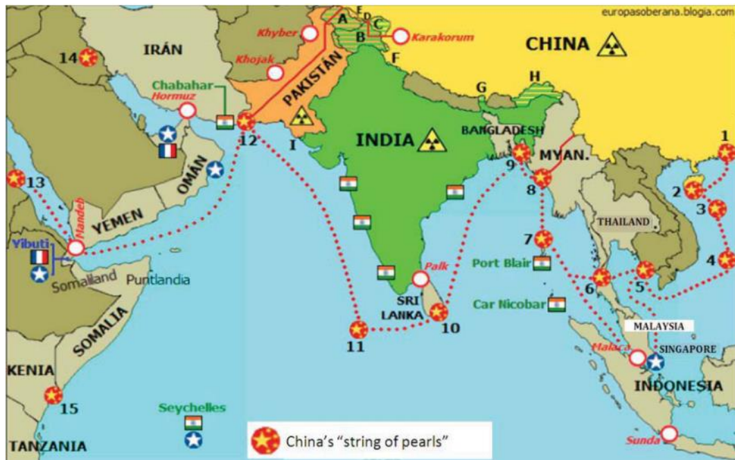
Figure 1: China's "String of Pearls" Map

Source: Heng, P. (September, 2012). Cambodia-China Relations: A Positive-Sum Game? . German Institute of Global and Area Studies, 57-85.